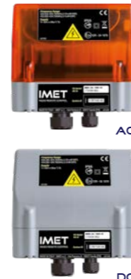
S AC / S DC