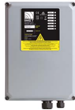
H AC / H DC