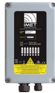
L AC / L DC